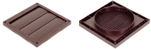
Front & Back View