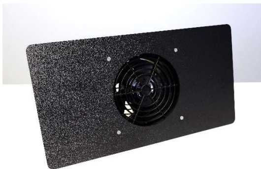
View of plate with protective grill inserted.